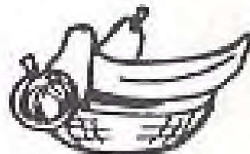
FRUITS OF LONGEVITY